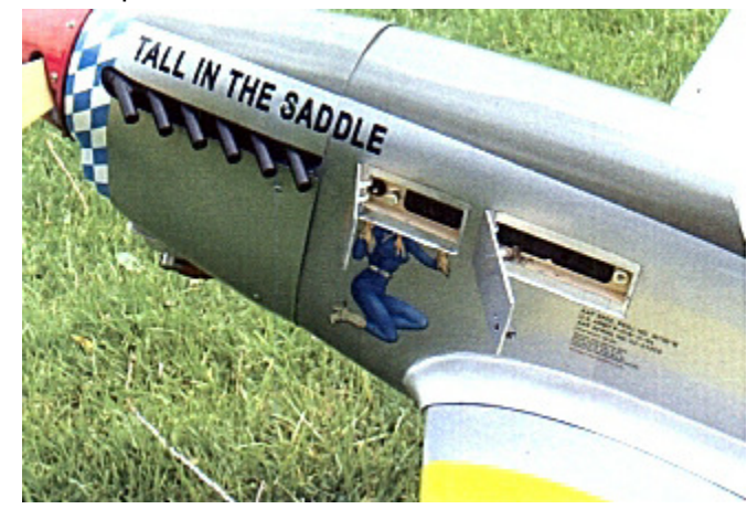
Above: Close-up photo of access doors to fueler, air supply for pneumatic retracts, and on-off switches. Engine exhaust stacks are operational via custom exhaust by Keleo Creations. Graphics by Cal-Grafx.

The move-up to giant scale was fostered by a $500 10-Year Anniversary recognition from Giles Engineering in 2003. In his fleet of giant scalers, Jim also has a ^{1}/_{3} scale Pitts Special with a Fuji 50 and a 103" span Extra 300 with a Desert Air DA-100.