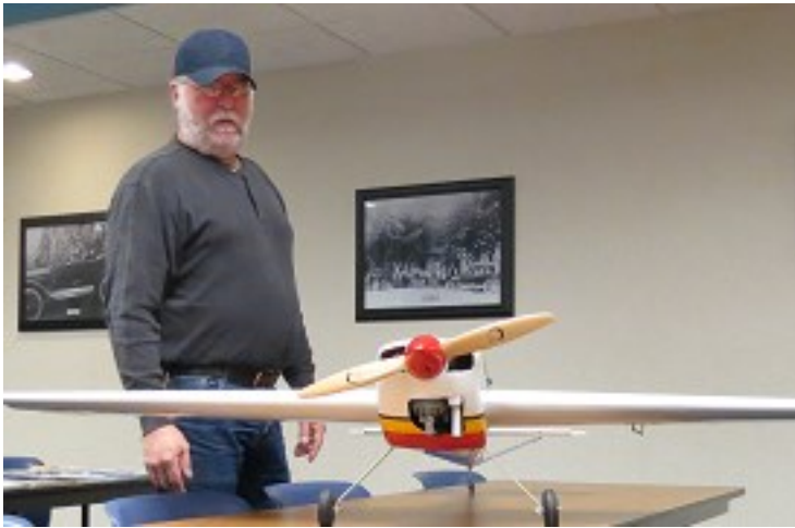
▲ 2014: Introducing a Seagull Edge 540