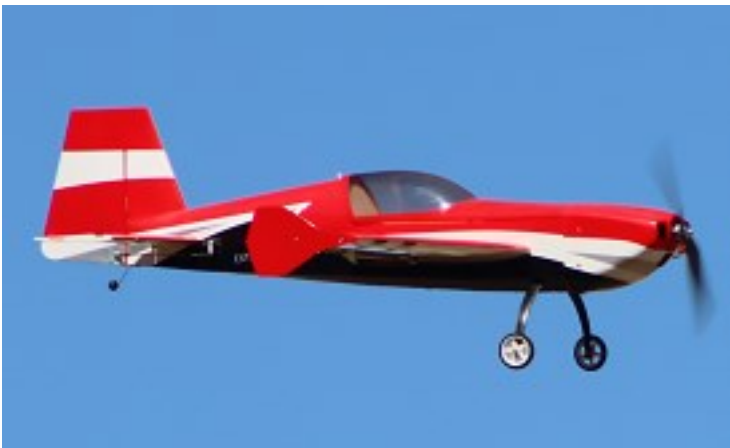
▲ Phil Schumacher - Extra 300