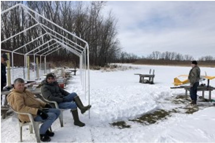
▲ 2020: Going to show us how to spring start