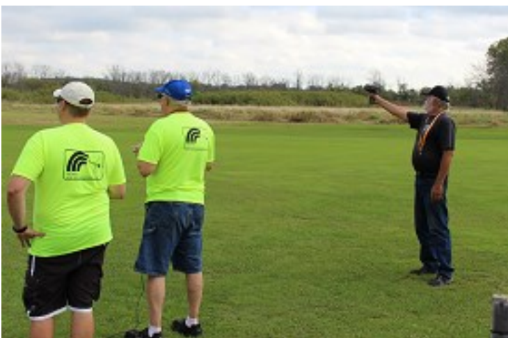
▲ Brave - Clocking the speed of the jet