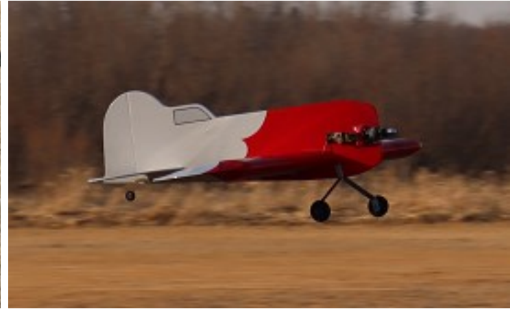
▲ Jeff Wisneski - Profile Gee Bee