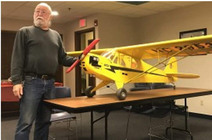
▲ 2019: Showing his new, giant Cub