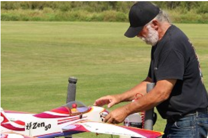
▲ 2017: Way too many flights on the Zen 50