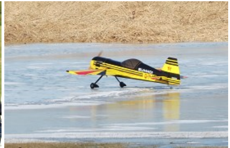
▲ Doing doughnuts on the ice!