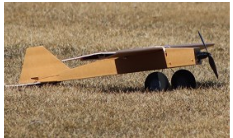
▲ Dale Abramczyk - Flite Test Stick