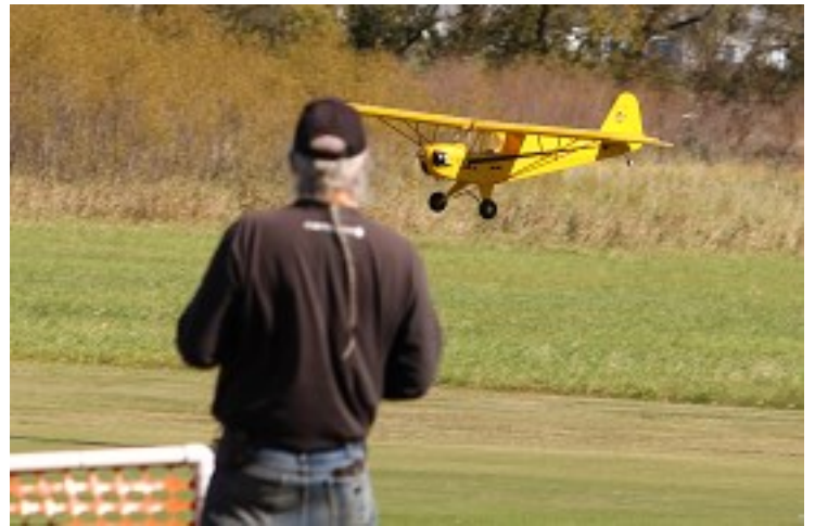
▲ And bringing that big boy in