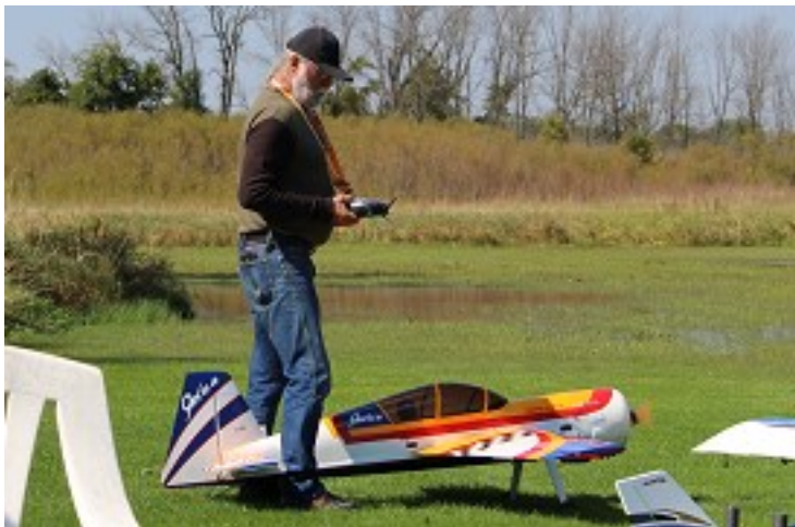
▲ 2018: About to fly the Yak