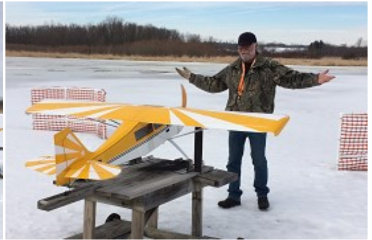
▲ Ta Da!