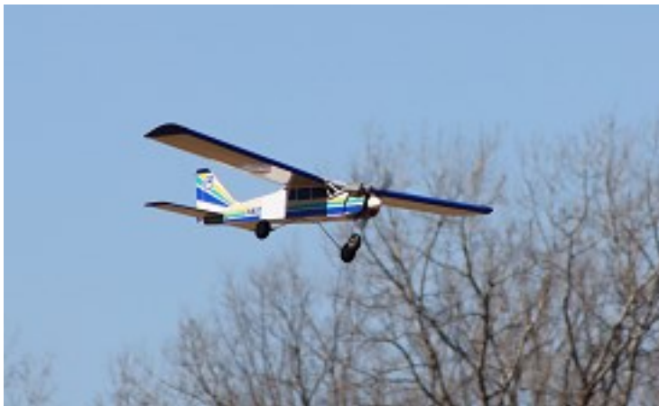
▲ Angie Traut - Tower Trainer 40