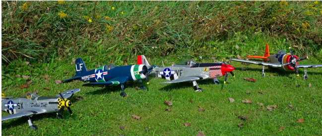
◀ A collection of foamie warbirds

It was a great day for a picnic, but could have been better for flying. We had a strong wind out of the Southwest, which made landings tricky. We were pleased to get a visit from a distinguished guest, Charlie, part of the Franklin K9 unit. More details below.