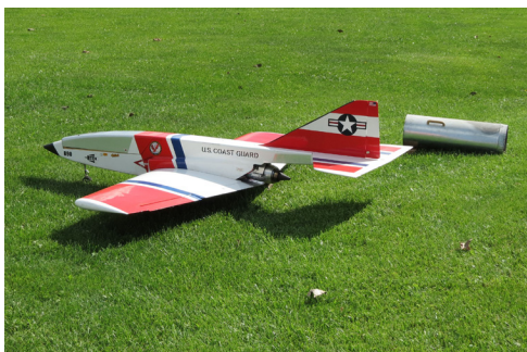
◀ Jeff Borowski's turbine powered aircraft is always a welcomed sight at the picnic.