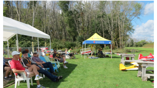
▲ Club Members in attendance