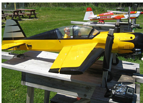
Planes waiting in the pits