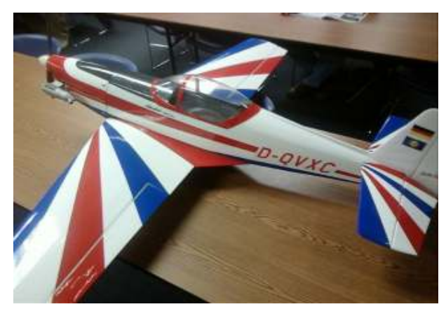
Phil Schumacher's Great Planes Acrobatic Electric ARF