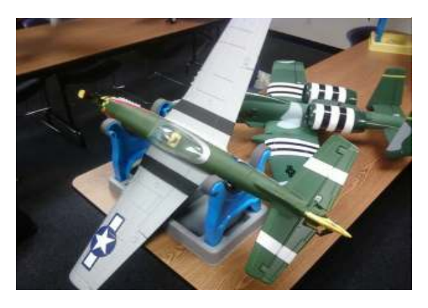
Chuck Beauchamp's P51 Mustang from Park Zone