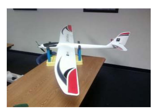
Chuck Beachamp's Radiant Glider