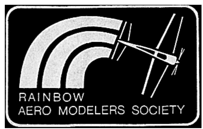
Founded Nov 6, 1980 Club #1264 Academy of Model Aeronautics