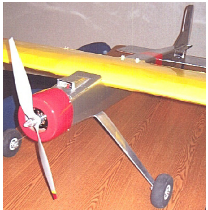
<u>Above</u>: Front view showing Hacker electric motor and its sizeable prop, plus large duraluminum gear.