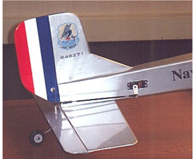
<u>Above</u>: Tail view showing example of kit modifications, where vertical fin is squared off, and elevator servo is rear-mounted, with exterior clevis system.