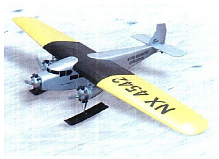
Ford Trimotor with Skis Electric ARF