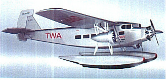
Ford Trimotor with Floats Electric ARF