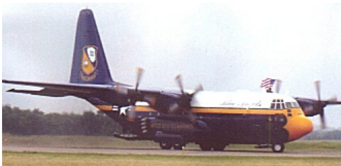
U.S. Navy Blue Angels C-130 Show Team support aircraft, July 12, 2005.