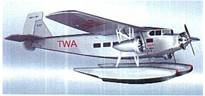
Ford Trimotor with Floats Electric ARF