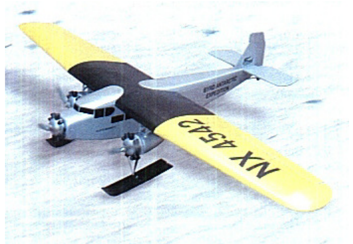
Ford Trimotor with Skis Electric ARF