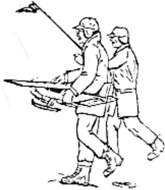
Above artwork from Rockford IL R/C Flyers, Ed. Fowler, Editor

Observations suggest that model aircraft may fly as well or better off snow with pontoon floats meant for water, than with skis meant for snow. The ridge on the bottom of pontoon floats cut into some snows, better resisting side slipping in a cross wind. Floats are longer and mounted sturdier, whereas snow skis are shorter, tending to flap about during flight.