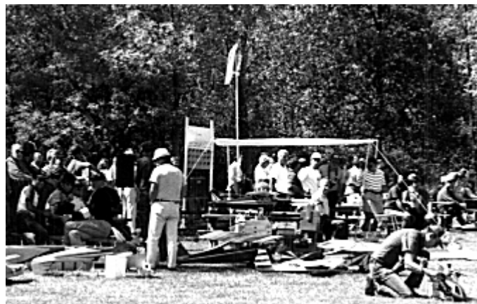
Above: A RAMS Club Fly-In of the same late 1980s early 1990s era as the above Rainbow Airport Fly-in.