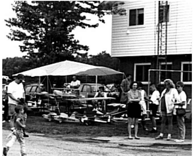
Above: Mid-'80s-mid-90s of a static exhibition on the south lawn of the Rainbow airport office (with residence above) by RAMS modelers during that airport's annual Pancake Breakfast Fly-In. Modelers were always respectfully received.

Q. Did the RAMS pioneer Club "Fly-Ins"? Ans. Yes and No. As the RAMS were forming in 1980, model aviation was rebelling against "Competition." Giant scale was coming into vogue, and their national organization (IMAA--Intl. Miniature Aircraft Assoc.) fostered "Fly-Ins," where you brought your model, maybe you flew it, maybe you didn't. " See and Be Seen " was adequate. At the same time the RAMS wanted to maintain good relations with Rainbow Airport, and we did that by putting on static exhibitions at their annual Fly-In, sometimes called a "Pancake Breakfast." Then as now, similar small airports (East Troy, Palmyra, etc.) put on an annual modest cost Sunday breakfast to provide a destination for week-end pilots to accrue flight hours. From that experience, the RAMS then started their own Fly-In, but oriented to our own members, except for invited guest demonstration pilots. Now most clubs have Fly-Ins, and most are open to all.