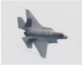
F-35 civilian air show debut