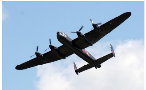
Not sure what this one is