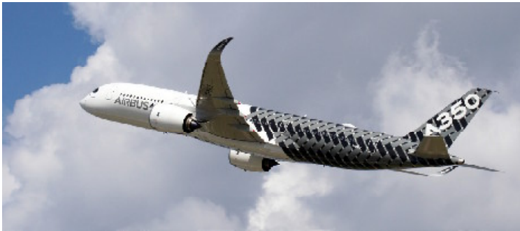
A350 demonstration (above and below)