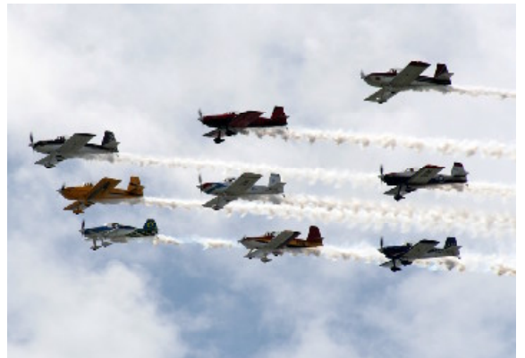
A whole lot of planes