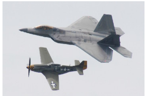
F-22 and P-51 Heritage Flight