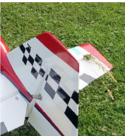
... taking cutting the grass to a new level.