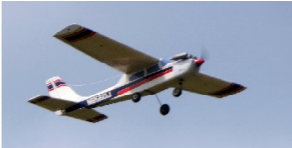
Cessna 172 possibly