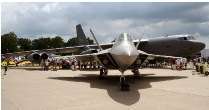
F-22 with B-52 in background