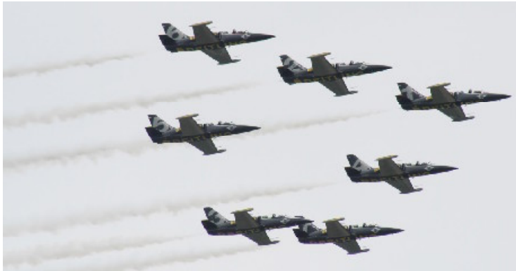
The USA debut of the Breitling Jet Team (above and below)