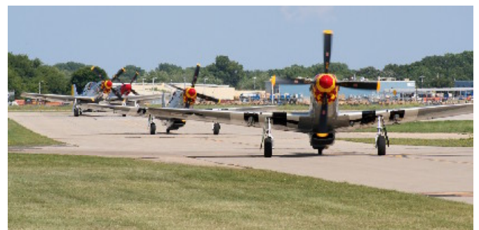
A line of P-51 Mustangs