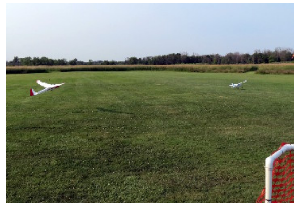
RC plane towing an RC sailplane