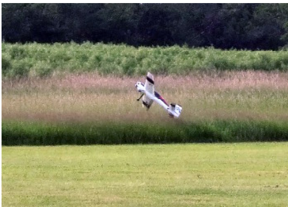
This was not a crash, but an amazing recovery.