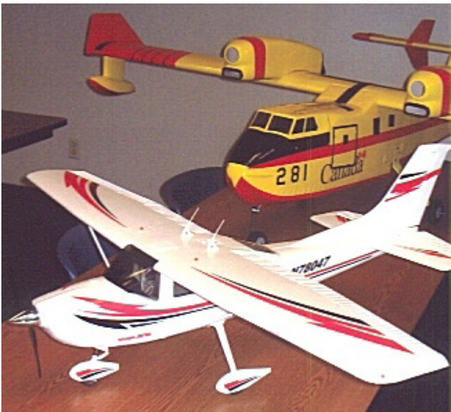
Above: Another view of Kegel's fire bomber showing air stream deflectors on main wing and tail stabilizer. Foreground: Mark Matelski's Cessna 182 Skylane, his first electric powered, from Great Planes.